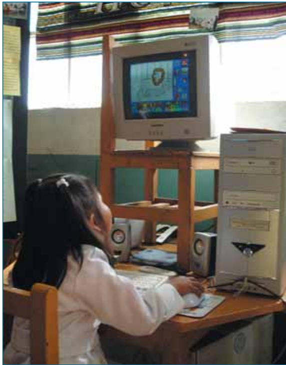
Up-scaling ICT for the future generation, Ayni, Bolivia.

Workshop participants also discussed the need to recognise information and communication as a democratic right. They emphasised the role for social interaction in providing and receiving information and content, and thereby generating knowledge. Participants saw ICT as a key instrument to strengthen democratic processes in the region.