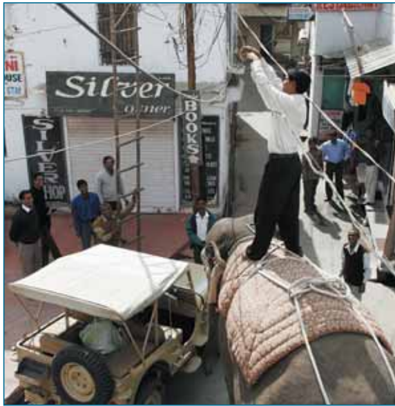
A man attempts to fix a wiring problem while standing on an elephant, Udaipur, Rajasthan, India