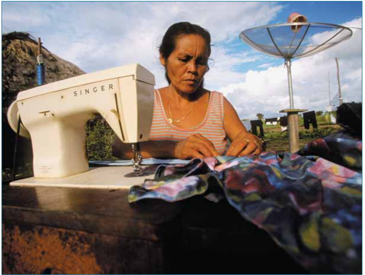
A Wapixana Indian woman using an old Singer sewing machine, the income from which enabled her family to afford a satellite dish and television set. The tribe live in a small reservation called Moskow, one of 160 territories protected by PP-G7, the Pilot Programme to Conserve the Brazilian Rainforest