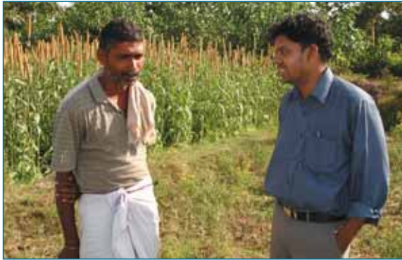
A knowledge centre manager interviewing a farmer