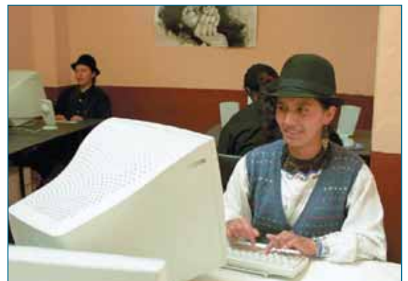
Considering the indigenous people, MCCH Ecuador.

In the Latin-American context, the multi-cultural aspects of indigenous and ethnic groups need to be considered. The specific needs of different target groups need to be understood and acknowledged in order to enable them to participate in formulating and implementing ICT programmes and policies. It is important to recognise the need to develop local content; standardisation of content is only possible to a limited extent.