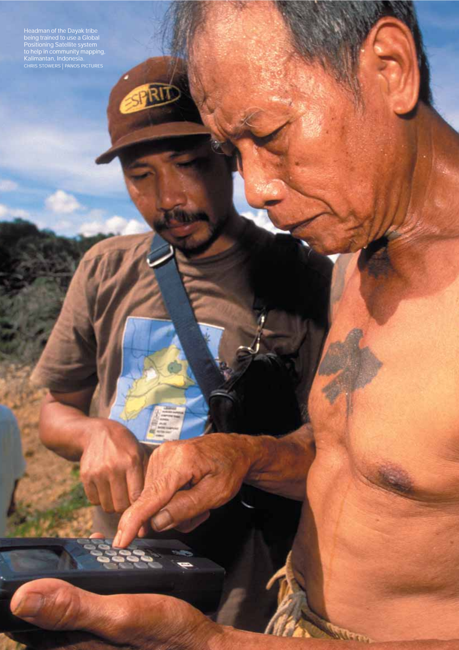
Headman of the Dayak tribe being trained to use a Global Positioning Satellite system to help in community mapping, Kalimantan, Indonesia.