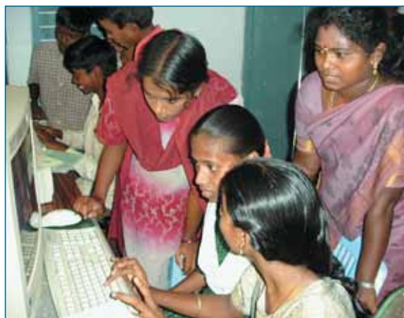
A knowledge worker helping children learn to use computers

From a small beginning to a mass movement. That is the story of India's Mission 2007, a mission for mobilising the power of information and communication technologies (ICTs) for meeting basic human needs. A mission that will harness the power of partnership to reach the unreached, the poor and the marginalised, and help them overcome poverty, hunger, malnutrition, and illiteracy. It is the story of a dream that will come true during this decade. The dream is to extend the knowledge revolution and its benefits to the millions living in the more than 637,000 villages of India for improving their lives on an environmentally sustainable and socially equitable basis. It is the grand vision of Professor Monkombu Swaminathan, the octogenarian who came under the influence of the Gandhian ideal of Antyodhaya as a young man and who has always set seemingly impossible targets for himself and his team but manages to achieve in the end.