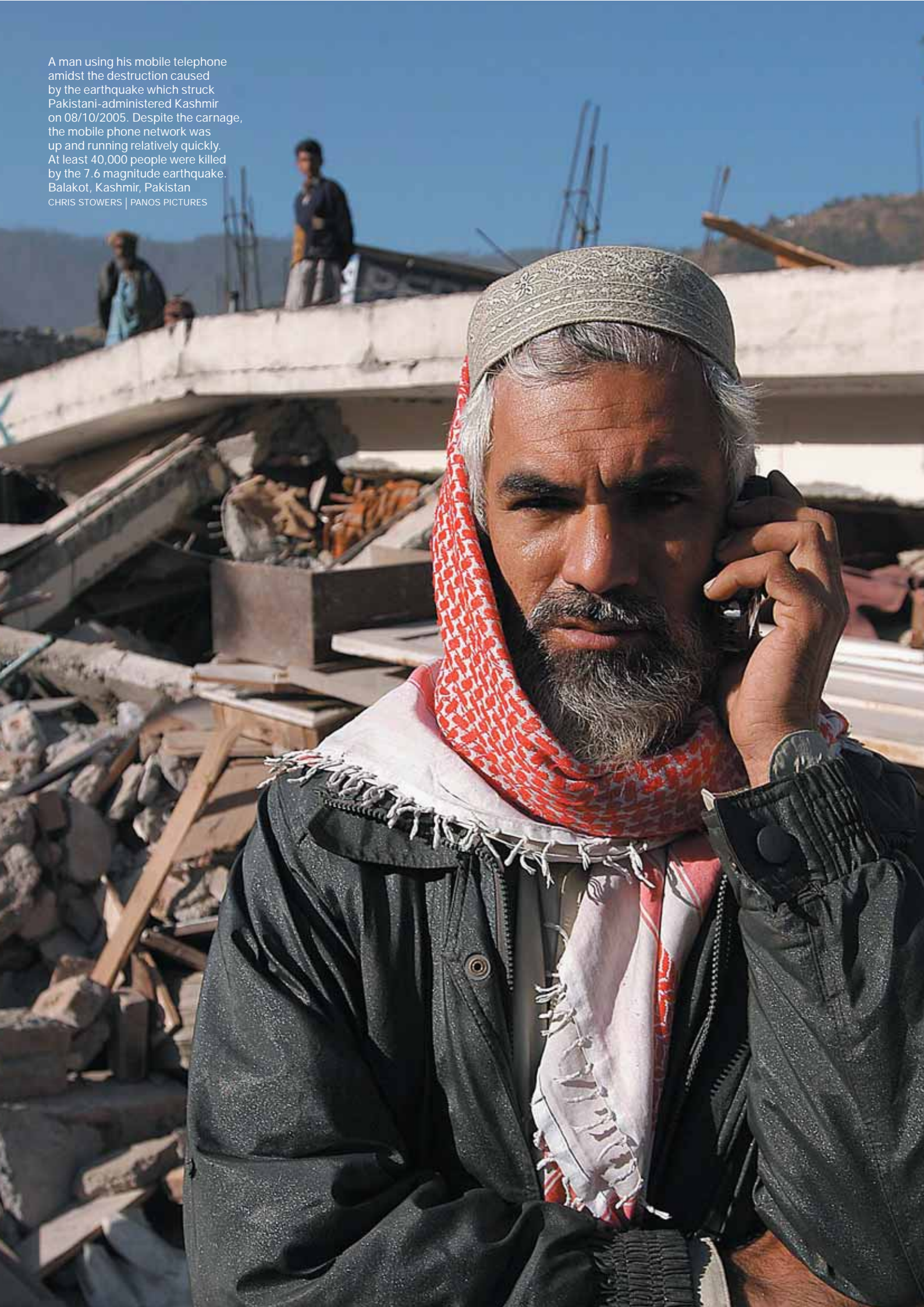
A man using his mobile telephone amidst the destruction caused by the earthquake which struck Pakistani-administered Kashmir on 08/10/2005. Despite the carnage, the mobile phone network was up and running relatively quickly. At least 40,000 people were killed by the 7.6 magnitude earthquake. Balakot, Kashmir, Pakistan