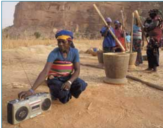
Dogon women listening to the radio as they work, Douentza, Mali.

While the high cost of satellite internet access will be too expensive for stations to bear when funding runs out, the project has shown what a difference the connection would make to the stations. It was also a chance to explore whether they would be able to use their internet access as a revenue stream by selling access to other organisations or groups in the community, as Radio Apac has attempted to do. The results are yet to be conclusive, but there seems to be little likelihood that the stations will be able to recoup connection costs until a critical mass of local population with purchasing power emerges. In the meantime, the impact shown by the project will be used to advocate for ongoing support until this critical mass can bring down internet access costs.