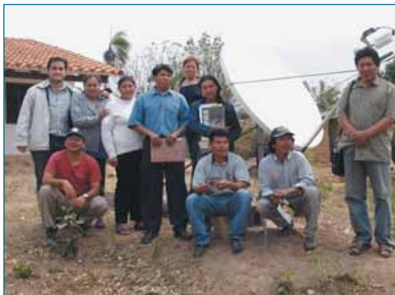
Satellite-based internet connectivity connects rural communities in Lomerio, APCOB Bolivia.

Different combinations of traditional and modern ICT are required, depending on the situation of the different user groups and areas of intervention, such as rural-urban, literate-illiterate users, indigenous users, gender, agriculture, education, health, and governance. A key consideration here is also to explore the use of open software as a means to democratise software application development. It is also important to complement ICT with the provision of related basic services, such as electricity and transport systems.