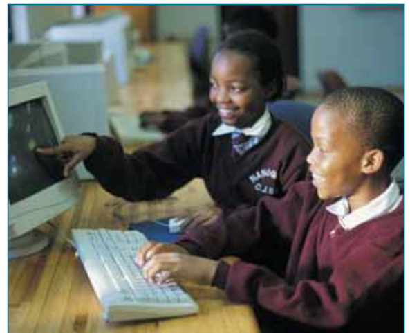
School children using computers at their primary school, Botswana.

Also important have been innovations at the level of coordination, which give new meaning to up-scaling by actions coordinated across a wide range of partners, addressing synergies and potentially reducing procurement and connectivity costs. See for example, the case of Mission 2007 in India. 16