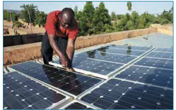
Maintaining the solar panels which power Radio Douentza, Mali.

Two years later, Apac, Rhino and Paidha are still struggling to survive, but things are looking up. All three stations have been making heavy use of their new minidisk recorders and microphones, thereby improving broadcast audio quality, and broadcasters have also reported much greater freedom to travel round the villages the station reaches. Paidha has, since the introduction of its internet connection, become a local news leader, reporting on national and world events that previously would take days to reach their audiences. Radio Rhino's new PC and printer have cut down on production time, allowing producers to access websites from the station, to type their scripts, to archive programmes on CD, and to maintain email contact with colleagues in Kampala and in other radio stations. Apac has tried to part-fund its internet connection by opening a small internet café on its premises, and offering low-cost web-literacy courses to local people. And feedback from listeners shows that they have noticed the change in the quality of broadcast programmes, and feel more involvement and ownership in their local stations.