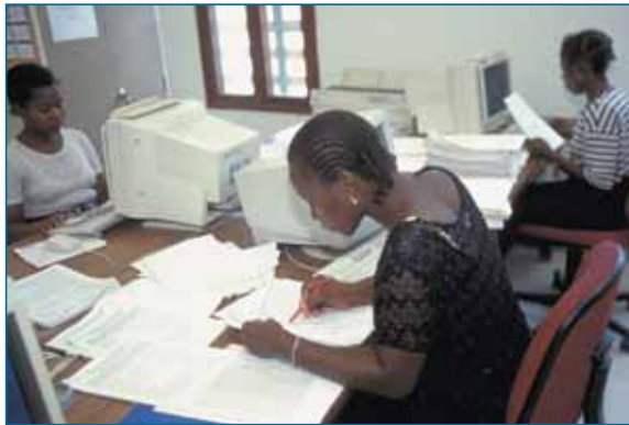
Collating test results, malaria research unit, Mozambique

The potential of the new technologies and approaches has also raised questions about how best to address the current disparities in access and costs across regions. The cost for the same type of broadband access is $1000–8000 dollars/month in parts of Africa, and $100/month in a similar context in Central Europe, whereas it could soon cost local communities in Andhra Pradesh, India as little as $2.93/month as a result of the government's new broadband initiative. What are the factors limiting investment in infrastructure and what might be ways to address the emerging gaps in network development, particularly in areas where investment is not likely to be commercially viable? How can regulatory policies productively address the tradeoffs and challenges of 'creative destruction'?