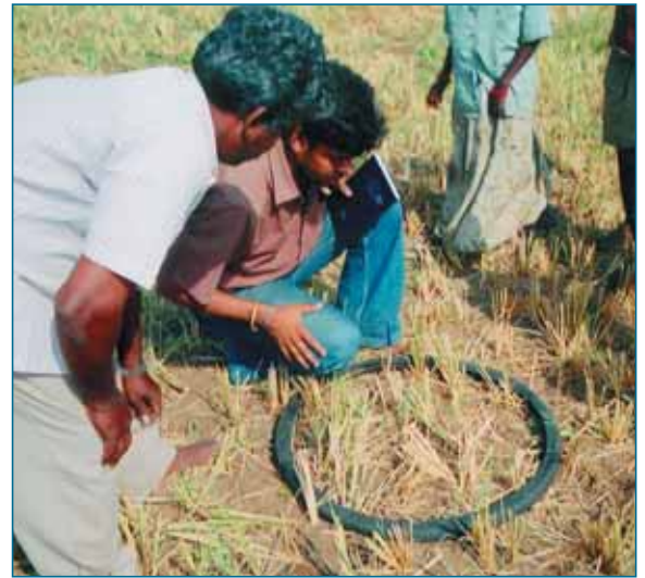
Assessing salt tolerance of rice plant.

The National Commission on Farmers, chaired by Prof. Swaminathan, has given many suggestions for improving public policies that are needed for the success of Mission 2007. These include judicious use of the universal service obligation funds, extending the reach of the 30,000 BSNL (the public sector telephone company) exchanges through wireless technologies and extending each of the exchanges to cover an additional 20 villages, enunciation of an innovative rural ICT policy, using the unlit (dark) portion of the fibre network, allowing civil society organisations to set up community radio stations, enabling Panchayats and self-help groups to take advantage of ICTs, setting up village knowledge centres in the poorest regions (e.g. areas declared as hunger hotspots and districts identified for rural employment guarantee) on priority, creating a cadre of more than a million NVA Fellows (at least one male and one female in each village), outsourcing government functions (e.g. digitisation of land records, local resource mapping) to those who run the knowledge centres, and setting up a venture capital fund to support rural service providers and knowledge centres. In addition, the support system for a rural knowledge revolution should be complemented by a national Digital Gateway for Rural Livelihood Security, says the Commission's report.