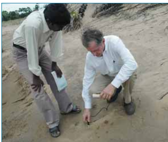
An expert testing Tsunami affected soil.

The seed for the new revolution was sown in 1997 when the M S Swaminathan Research Foundation (MSSRF) embarked upon a programme that would use access to knowledge as the key to holistic rural development. A few months later, in January 1998, the Information Village Research Project was established with financial support from the International Development Research Centre (IDRC), Canada. Initially, MSSRF set up information centres, later to be rechristened knowledge centres, in three villages near Pondicherry, to provide the information relevant to the people’s daily lives. As there was no prior experience (nor any model to follow), progress was slow and faltering. Indeed, a few of the early centres housed in individuals’ homes had to be closed down, as the benefits were not reaching all members of the community, especially people belonging to the historically marginalised Dalit community. Social inclusion, reaching the unreached and voicing the voiceless, are articles of faith in the MSSRF-IDRC ICT-enabled development programme.